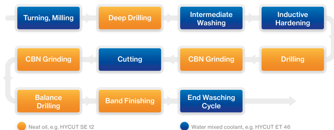
Figure 1: Process chain layout

This LCA was carried out as a case study at a German car manufacturer's engine plant in Austria. The process chain for crankshaft production was under scrutiny here: this involves the most diverse machining processes, including milling, turning, deep drilling and grinding. The process chain also involves frequent changes between water-miscible and non-water-miscible MWFs (see Figure 1).